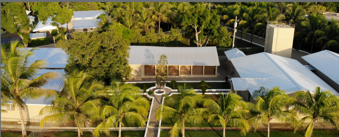
HORNSBY PRAYER & EQUIPPING HUB - DILAIRE, HAITI